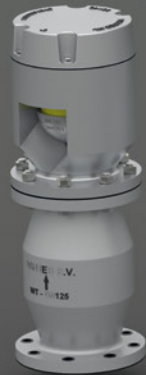
WIN2000 HIAS with Watertrap