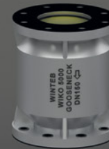
Gooseneck Inverted (top down also available)