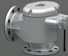
WIKO 5000 Type 1A Angle Type (with side outlet) Heated