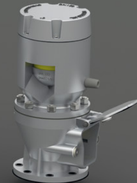
WIN2000 HIAS with Liquid Mud Valve

Made of seawater resistant Aluminium DIN1725 | Non corroding | Maintenance free | Smallest design available