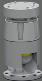
WIN2000 HIAS with PV Valve