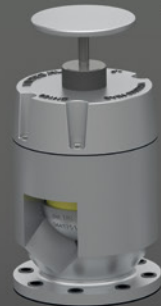
WIN2000 HIAS Closable