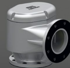
WIKO 5000 Type 1A Angle Type (with side outlet)