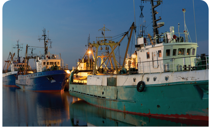
Commercial fishing vessel using large volumes of seawater.

Our innovative solutions provide an automated treatment process so you don't have to worry whether it's work or not. Our data capturing capabilities proves our system is functioning properly and eliminating cross contamination during operation.