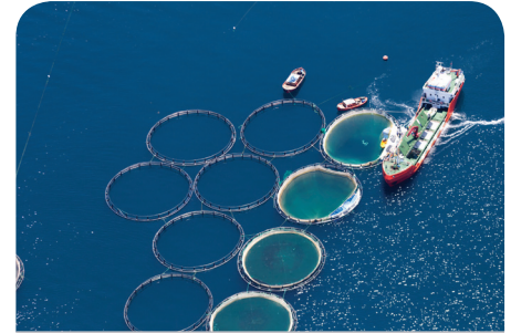
Ocean base fish farming operation.

maximize operation’s efficiency by treating contaminated and turbid processing liquids in a single pass. Many seawater applications around the world involve growing or transportation of live product. Bioionix has developed seawater treatment systems that not only provides you with the disinfection needed for your operation but also has the ability to keep your product alive. Our latest testing results show no change or harm to fish species being tested – even the most fragile gill tissues show no signs of change between fish exposed to our treated water versus fish in a “normal” controlled environment.