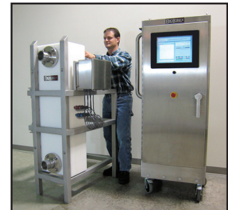
BioIonix's test lab and field pilot units demonstrate equipment performance for new customer applications.

BioIonix, Inc. is located in the Madison, Wisconsin area, home to many high technology companies. BioIonix's breakthrough disinfection process eliminates the costs and hazards of chemical disinfectants and overcomes the disadvantages of other disinfection methods in food processing applications. This energy-efficient, environmentally-friendly process solves serious biological disinfection and water reuse challenges facing food processors worldwide.