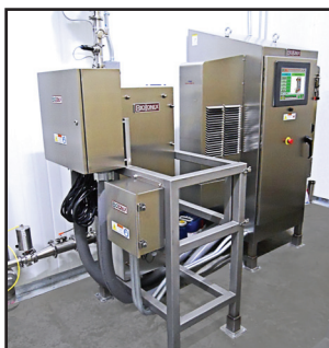
BioIonix brine disinfection system. Its compact footprint fits even in tight plant layouts.